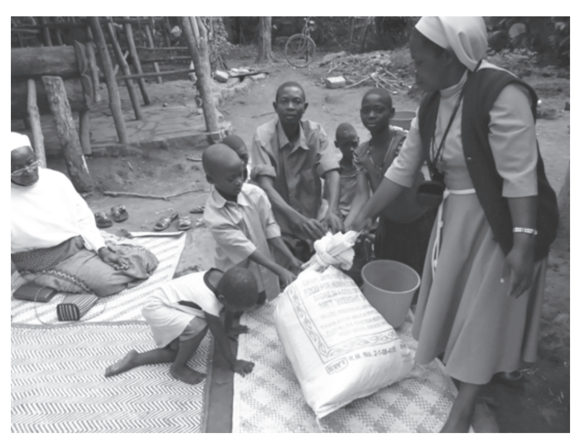
FIGURE 2. CATHOLIC WOMEN RELIGIOUS IN AFRICA IN THE SERVICE OF THE POOR

In the social domain, sisters work with refugees, either in camps or in centers, where they provide for their spiritual and material needs, counseling services, academic and entrepreneurial knowledge and skills. They also reach out to street children and to mothers, physically and mentally challenged persons, orphaned children and single