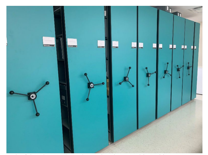
Colorful endcaps adorn the updated, moveable archives storage of the OSF Healthcare Archives of the Sisters of the Third Order of St. Francis in East Peoria, Illinois in 2021.

Also, no one is a digital native. So the way records are being kept on computers — or are they even kept? — someone told me the newsletter she sent out to the group she runs, she just deletes. She uses the template but she deletes the old one. So I was sort of asking the people who receive that [newsletter], "Does anyone have copies of these?" The people don't, and me, too, myself, the way I keep records on a computer is so different than when I was teaching and had all my files in order. It is a lot harder for people even to know what they have. They might know it is valuable, but where is it? (Archivists' Focus Group)